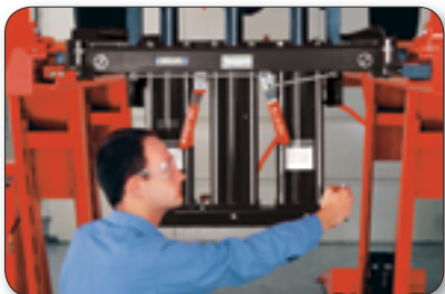
Swing Air-Jack, 133-83-1 9,000 lb. (4082 kg) Capacity