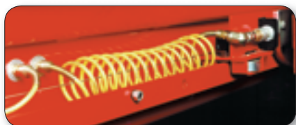
Air Line Kit Provides an air source at the front and rear for jacks and air tools.