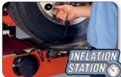
Integrated Inflation Reels (-IS models) Automatically fills or bleeds each tire.